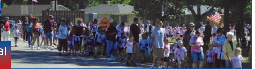
St. Lucy School Annual Memorial Day Walk to Pritchard Park Friday, May 28, 2010