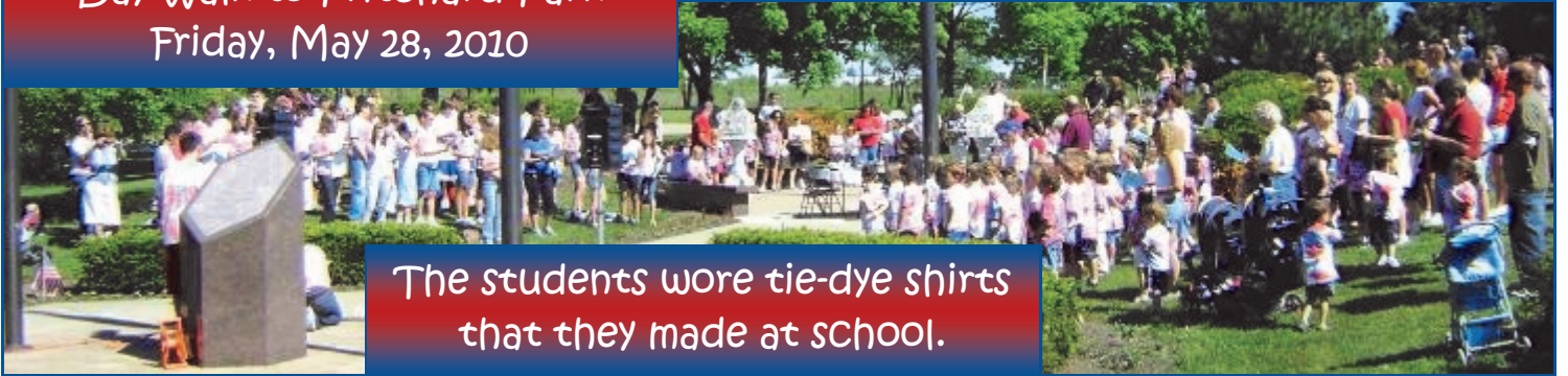
The students wore tie-dye shirts that they made at school.